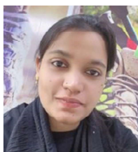
By: Samina Akhter

According to the government-to-government pact between Myanmar and Bangladesh, Myanmar has conveyed over 140,000 tonnes of white rice to Bangladesh, according to the Ministry of Commerce of Myanmar.